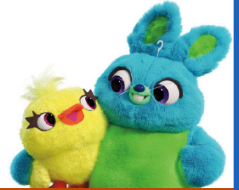
DUCKY & BUNNY